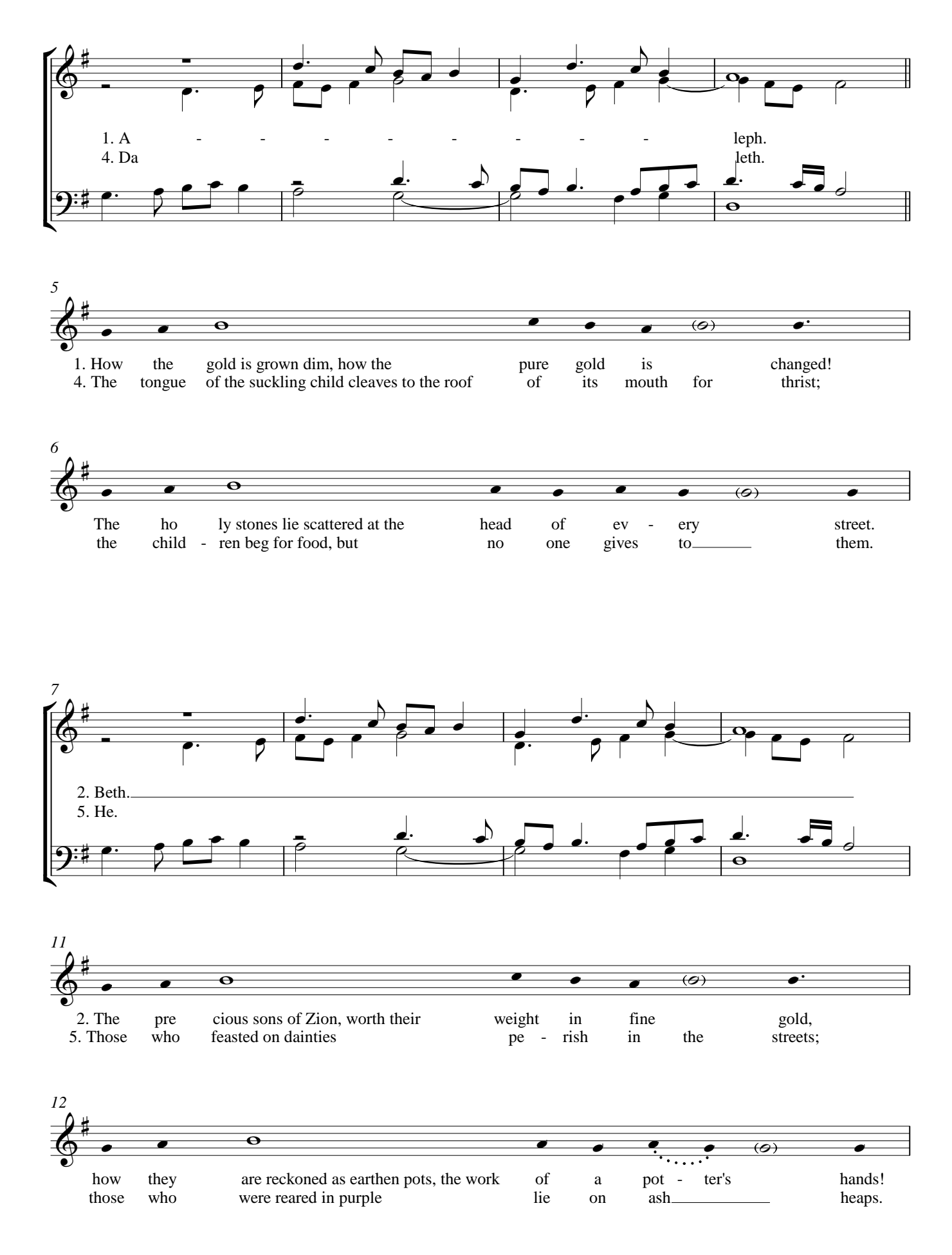
Tenebrae - Holy Saturday MATINS 1st Nocturne