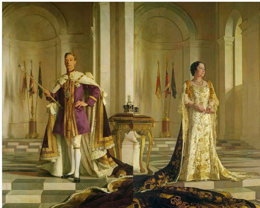
Coronation portraits of King George VI and Queen Elizabeth (Sir Gerald Festus Kelly)