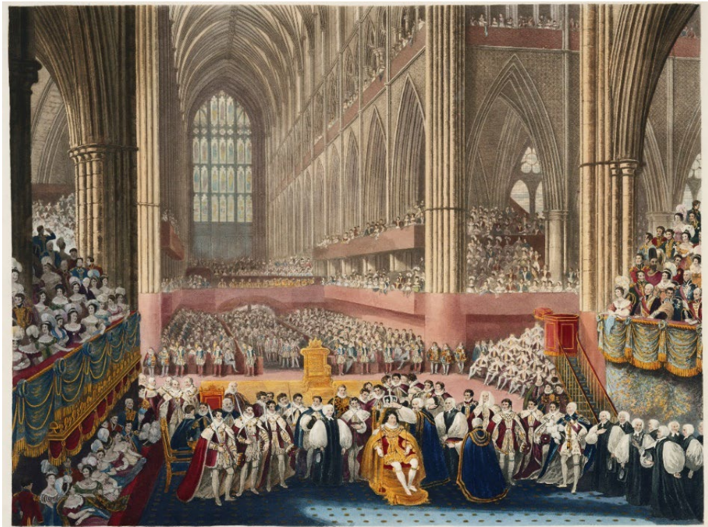
An etching of the coronation of King George IV on 19 July 1821 (after James Stephanoff).

Further implied amendments were made to the Coronation Oath taken by King George IV in 1821. 37 Not only was “Great Britain” replaced with “the United Kingdom” (reflecting the 1801 Union between Great Britain and Ireland) but the third part of the Oath now included a promise to maintain the settlement of the “united church of England and Ireland” (the fifth article of the Union with Ireland Act 1800 having united the two churches). 38