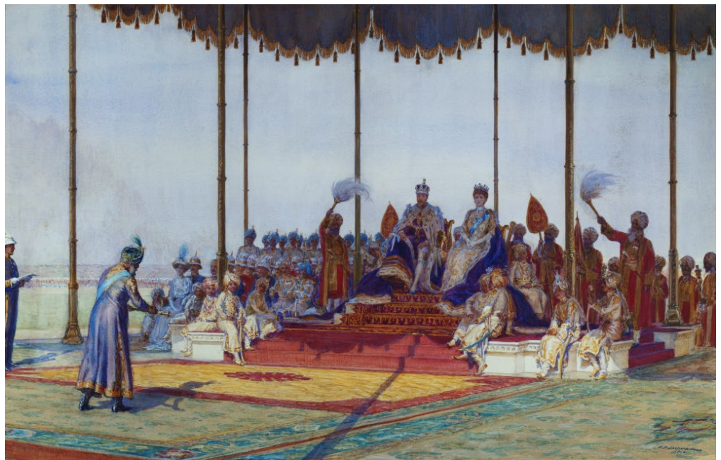
King George V and Queen Mary at the Delhi Durbar of 12 December 1911 (George Percy Jacomb-Hood)

On 12 December 1911, King George V and Queen Mary received the homage of Indian rulers as Emperor and Empress of India. As it was the convention not to remove the regalia from the Realm, 438 a new Imperial Crown of India was specially made for the Delhi Durbar. 439 There was no crowning, but the Imperial Crown was worn throughout the ceremony.