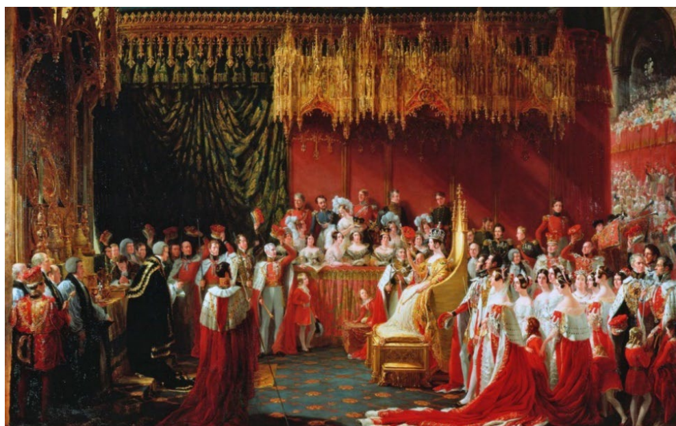
The Coronation of Queen Victoria in Westminster Abbey, 28 June 1838 (George Hayter).

In 1829, George IV was forced by his ministers, much against his will and his interpretation of his Coronation Oath, to assent to Catholic emancipation. 41 His successor, William IV, initially refused to have a coronation at all, but eventually agreed to a more modest ceremony which took place in 1831. 42 This dispensed with the procession from Westminster Hall and the post-coronation banquet, neither of which were subsequently revived. William was crowned with George I’s old state crown; rather than having it remodelled he inserted padding so that it would fit. 43 For the first time the monarch processed in the 1762 Gold State Coach, which has been used at every coronation since. 44