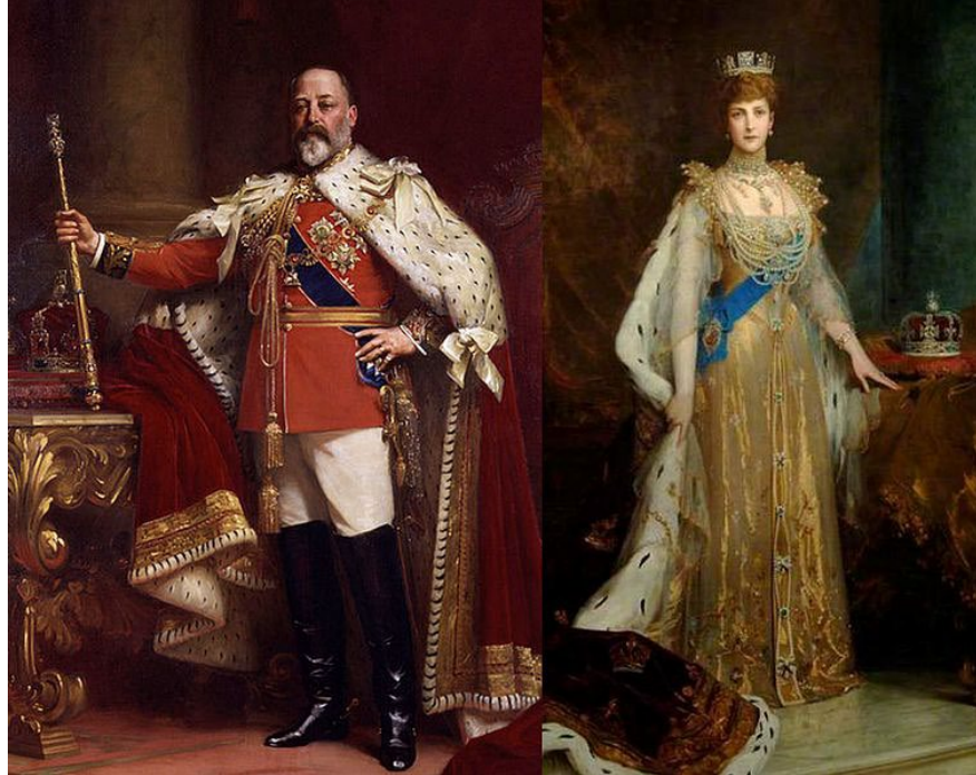
King Edward VII and Queen Alexandra in their coronation robes (Sir Luke Fildes)

According to a report in the Mail on Sunday, the King would like “all serving frontline members of the police, fire, emergency services, prison services and the Armed Forces to be given a medal”, just as they were during Queen Elizabeth II’s Platinum Jubilee in 2022. Coronation medals have been issued for each British monarch since the coronation of King George IV in 1821. 437