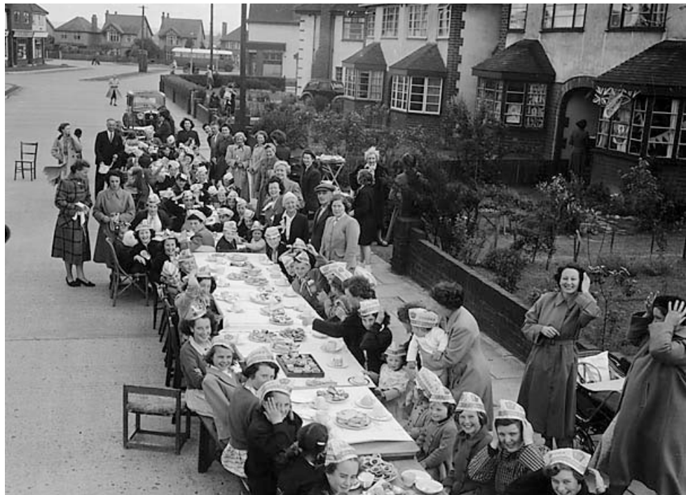
A 1953 coronation street party in Shrewsbury

The Ministry of Food granted 82 applications for people to roast oxen if they could prove that, by tradition, an ox had been roasted at previous coronations. Coronation Chicken was invented for the foreign guests who were to be entertained after the coronation. 407