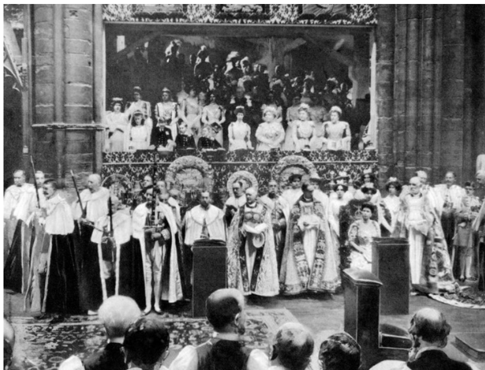
George V shortly before his Anointing.

The Department for Culture, Media and Sport offered funding to the Devolved Administrations, the Mayoral Combined Authorities in England and to ten local authorities in England covering the largest urban populations as a contribution to the cost of hosting public screenings of the Coronation and Coronation Concert. The total amount offered for Coronation screenings was £840,000 which will ensure that we capitalise on the unique opportunity the Coronation offers to bring people and communities together in celebration and showcase the best of the UK to the world. 384