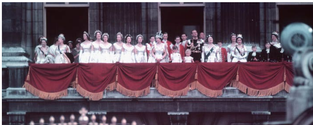
Queen Elizabeth II’s balcony appearance on 2 June 1953 (Library and Archives Canada, K-000046).

balcony appearances. In 1953 there were five, the first being to view a fly-past of hundreds of planes in a group choreographed to form the letters “ER”. 394