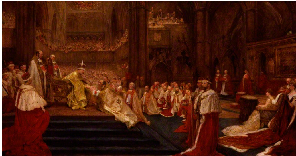
The Homage at Edward VII's coronation on 9 August 1902 (John Henry Frederick Bacon).

not only with emblems of the United Kingdom but also the lotus of India and the Star of Africa, “with the oceans linking the Empire swirling around its hem”. 54