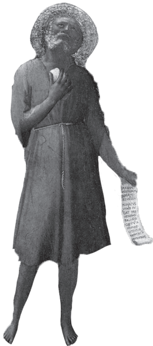
O My God, I am Heartily Sorry