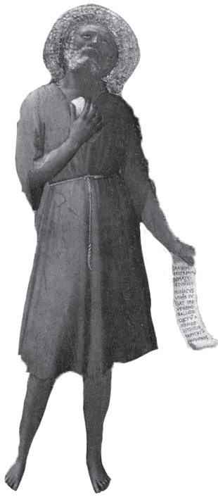
O My God, I am Heartily Sorry