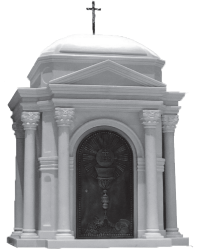
I Turn Toward the Holy Tabernacle