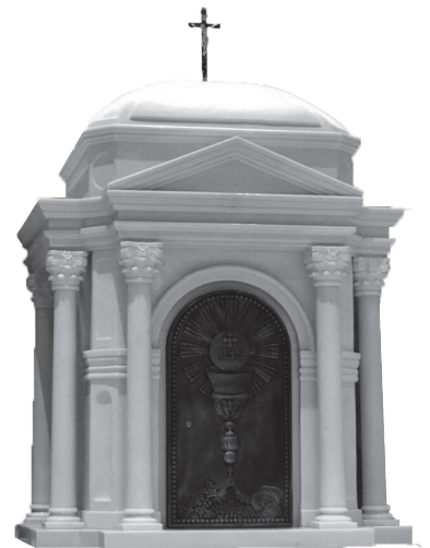
I Turn Toward the Holy Tabernacle